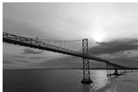
Figure 1: First Chesapeake Bay Bridge Crossing Maryland; Opened 1952